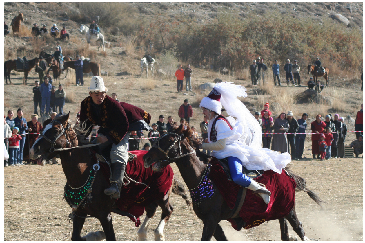
At Chabysh

festival includes long-distance horse races (open only to Old Kyrgyz horses), traditional horse games, handicraft exhibitions, musical and theater performances and guest artists from other horse-centered traditions. In 2005 and 2006, Vista 360° presented American cowboy music and rodeo games at At Chabysh. In the future, they plan to present horse traditions from all around the world. Only two years old, the At Chabysh festival is already well-known in Kyrgyzstan and has the potential to have the same kind of broad impact demonstrated by the Cowboy Gathering in the U.S.