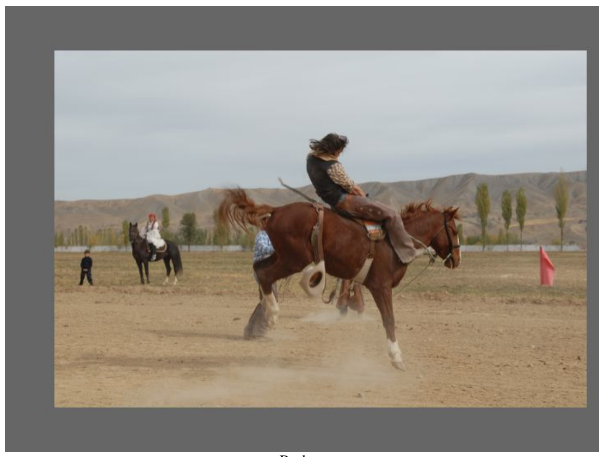
Rodeo

Another example: at the At Chabysh festival, we met a musical group called KUT , which we are now bringing to the U.S. for a four-state tour to introduce Kyrgyz traditional music to rural audiences in the Rocky Mountain region. One of KUT's members is devoted to re-creating some of the ancient music of Kyrgyzstan, which now survives only in fragments. The tour is designed to give KUT musicians as much opportunity as possible to play with American musicians and to explore a variety of musical styles. They will also be recording their first CD with the help of the Western Folklife Center, including some of these ancient songs.