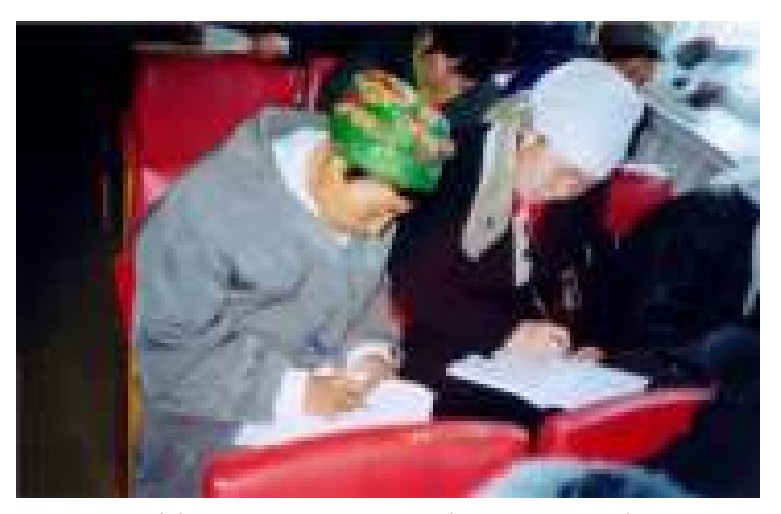
Women participants at the computer literacy courses in Kyrgyzstan

for different women groups in the villages. The main priorities are planning small and medium business and land relations. Women in the mountain villages communicate and share information in the global women network through the world wide Internet recourses. In Public Information Centers in the villages women can get access via single "window" to various application forms for obtaining different services. Such applications can be printed and filled in by citizens according to instructions and rules at home or in public information centers at different locations before visiting related organizations. As a result people can get out of a habit to gratify civil servants for quick service delivery and reliable information which lead to reduction of corruption in government agencies.