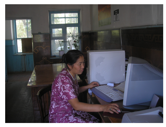
New computer equipment at Aiyl Okmoty

Computer literacy courses including trainings on Internet and e-mailing are conducted for interested groups of local people on reasonable chargeable base. Along with pilot Aiyl Okmotu (local municipalities) employees representatives of neighbouring Aiyl Okmotus have been trained on computer literacy free of charge through the centers. At the same time they receive consultations and technical support on elaborating plans of socio economic development of Aiyl Okmotus. The number of trained Aiyl Okmotu representatives increased from 10% to 70% and that helps to improve the quality of their daily duties. As a result they have got possibilities to prepare timely efficient reports and use legislation in electronic format. Furthermore Aiyl Okmotu has an opportunity to arrange data inter exchange with the government structures by e-mailing system. Computerized municipal management system including management of local recourses and finances is under development in close collaboration with Ministry of Finance and Agency on Local Self Governance and will be established in pilot electronic Aiyl Okmotus as soon as development will be completed.