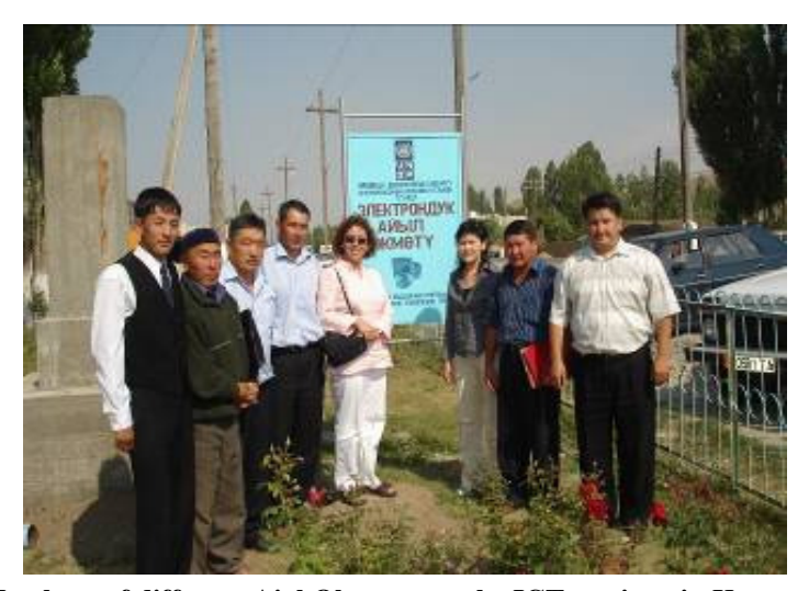
Members of different Aiyl Okmotus at the ICT seminar in Kyrgyzstan

The one of significant activities of UNDP in ICTD area is awareness raising campaign in the mountain regions about the opportunities to get access to information and services including knowledge recourses for women through Public Information centers in pilot municipalities.